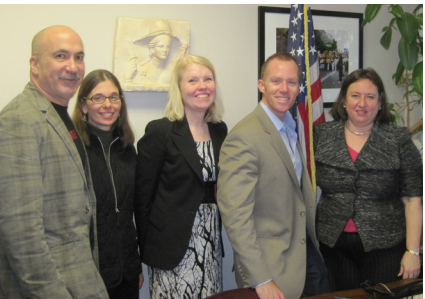
St. Francis Xavier Church's Peace & Justice committee met with Rep. Carolyn Maloney (D-NY)