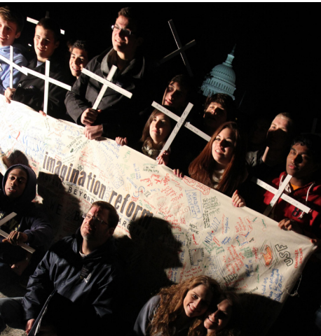
Students gather at the public witness on Capitol Hill

The 2012 program brought together nearly 1,100 faith-justice advocates from over 40 Jesuit & Catholic high schools, colleges, parishes and ministries to learn, pray, and act for justice. Sr. Simone Campbell (Nuns on the Bus) and other prophetic voices invited participants to engage in “imagination reform” to redefine what is possible in the struggle for justice.