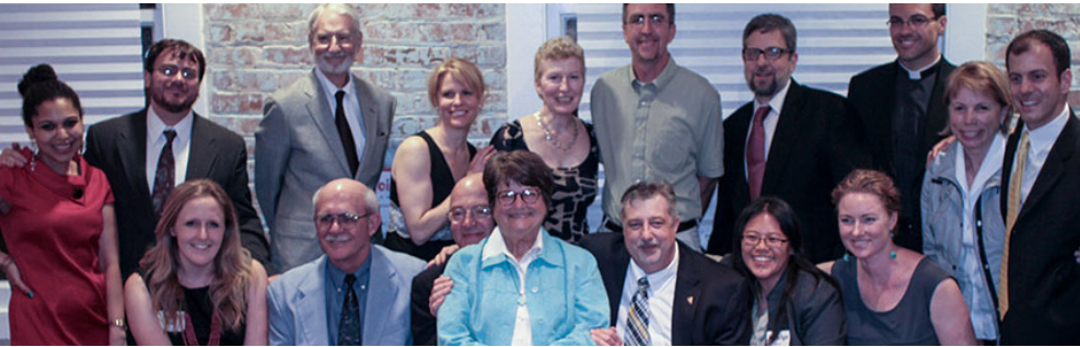
ISN's board of directors and staff with Sr. Helen Prejean at the award reception in New Orleans, LA