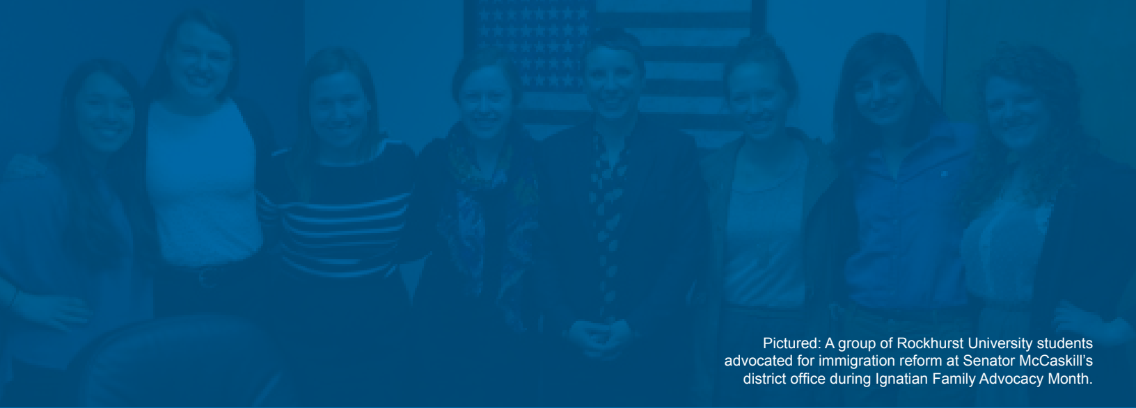
Pictured: A group of Rockhurst University students advocated for immigration reform at Senator McCaskill's district office during Ignatian Family Advocacy Month.